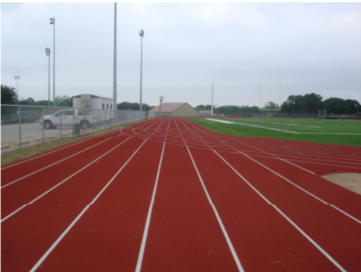
Trinity High School – View of track straightaway.