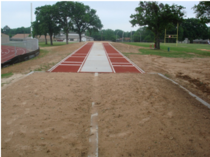
Trinity High School – Long jump sand pit and runways.