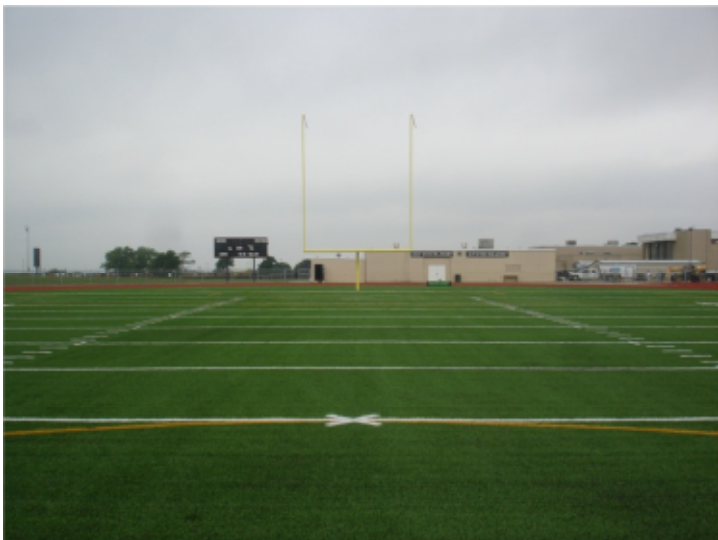
Trinity High School – View from 50-yard line.