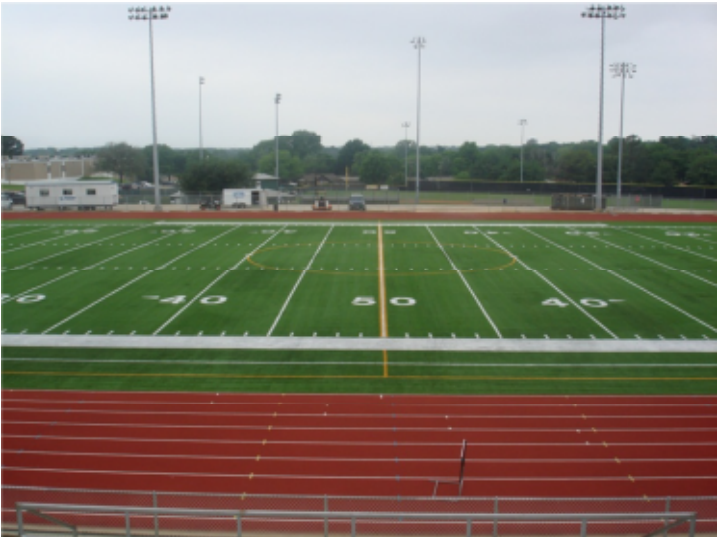
Trinity High School – View from bleachers.