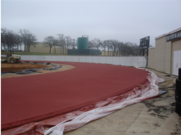
Trinity High School – Track surface at curve.