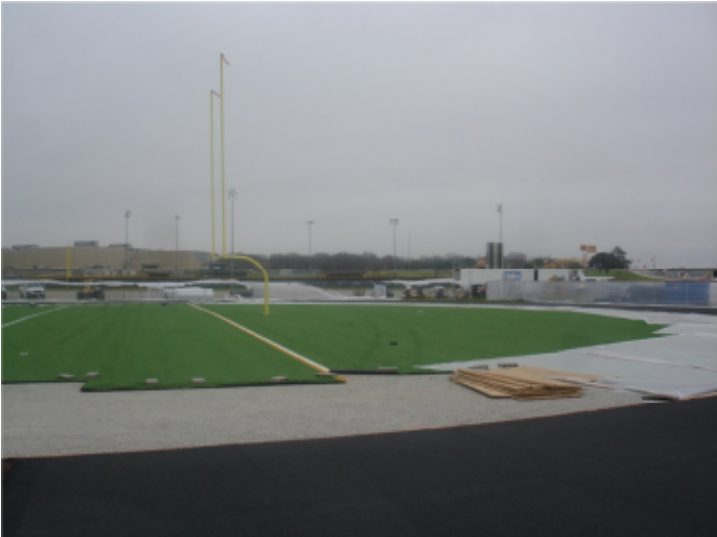
L.D. Bell High School - Turf at the "D" area.