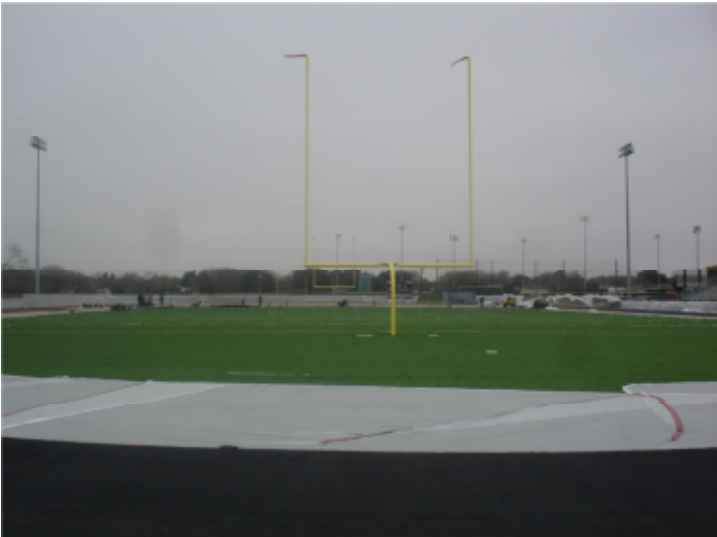
L. D. Bell High School – Overall view of field turf progress.