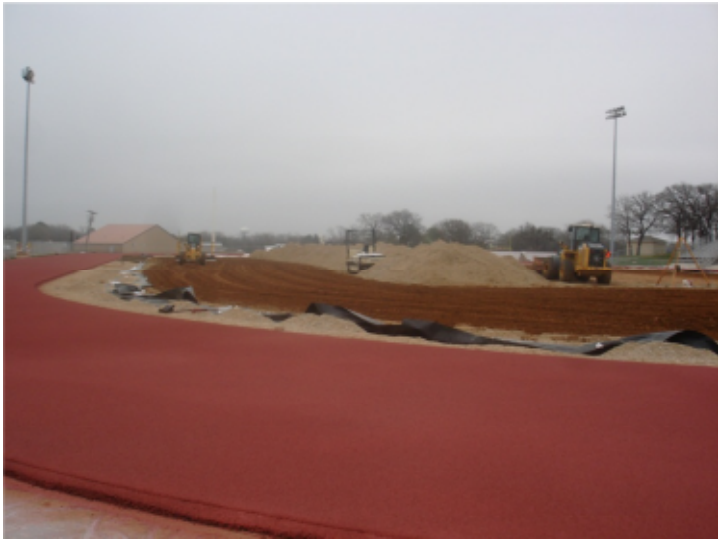
Trinity High School - Structural spray of track area; reworking subgrade of field.