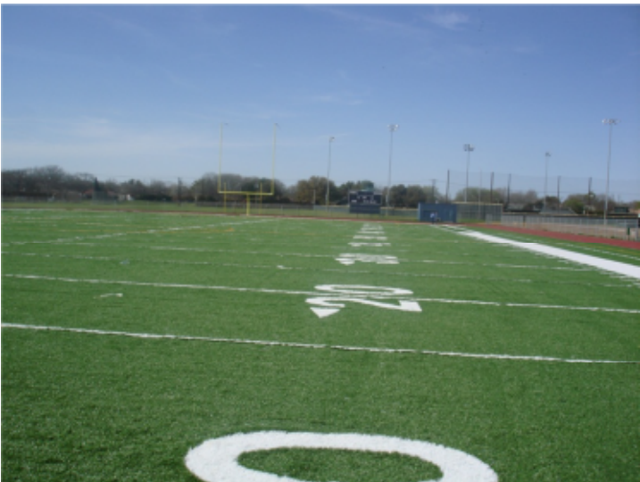
L.D. Bell High School – Number inlays and field markings.