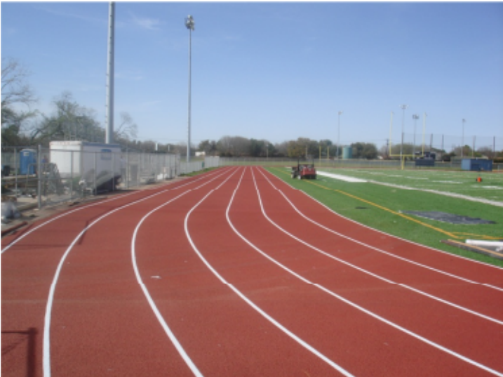
L. D. Bell High School – Completed lane striping.