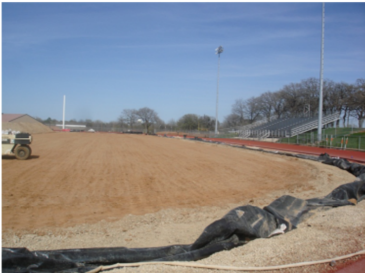
Trinity High School – Subgrade work of field.