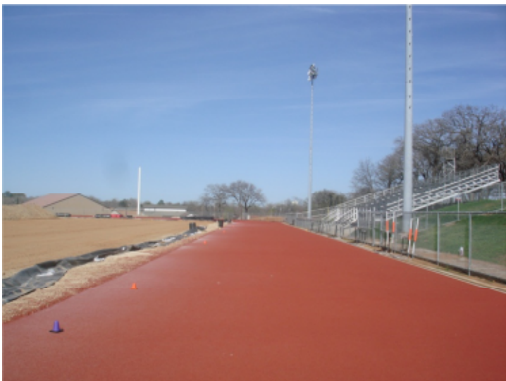
Trinity High School – Completed installation of track surface.